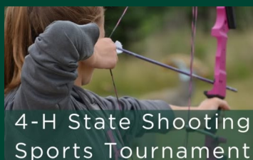
4-H State Shooting Sports Tournament